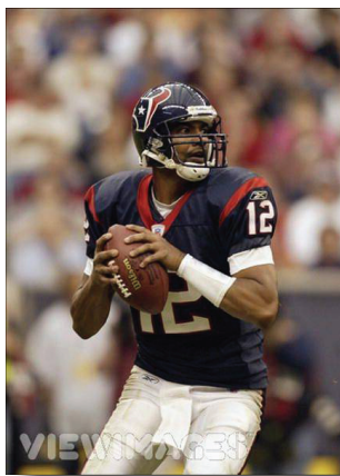
Former NFL Quarterback Tony Banks

Today's students are starved for great role models.