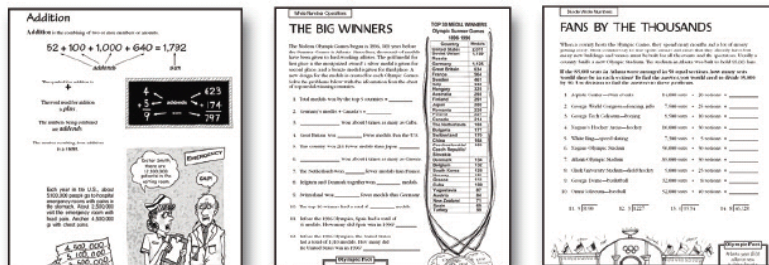
Printable Customized Instructional Workbooks